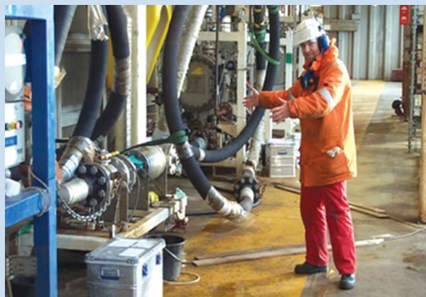
Typical North Sea CTour Test Facility Setup

ProSep Inc., which consists of ProPure, ProPure ME, ProSep Technologies, Inc., and ProSep AP, is the exclusive supplier of the CTour patented technology.